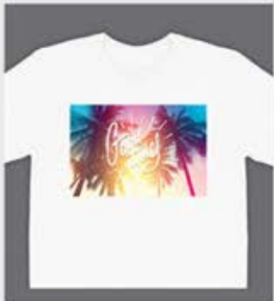
Produced with: TECHNI-PRINT® EZP Paper