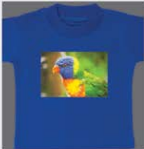
Produced with: LASER-1-OPAQUE®