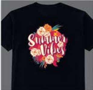
Produced with: 3G JET OPAQUE® Paper