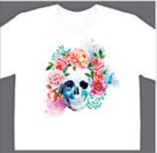
Produced with: JET-PRO® SS Paper