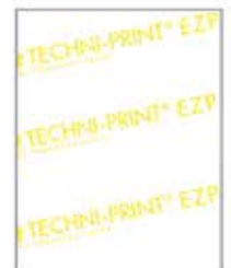
LASER | LIGHT