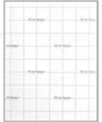
INKJET | DARK